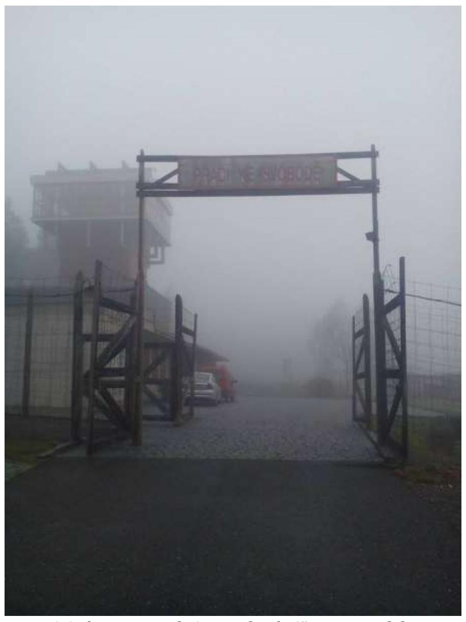
The Nazi infamous "Arbeit macht frei" was used here as well ("Prací ke svobodě")