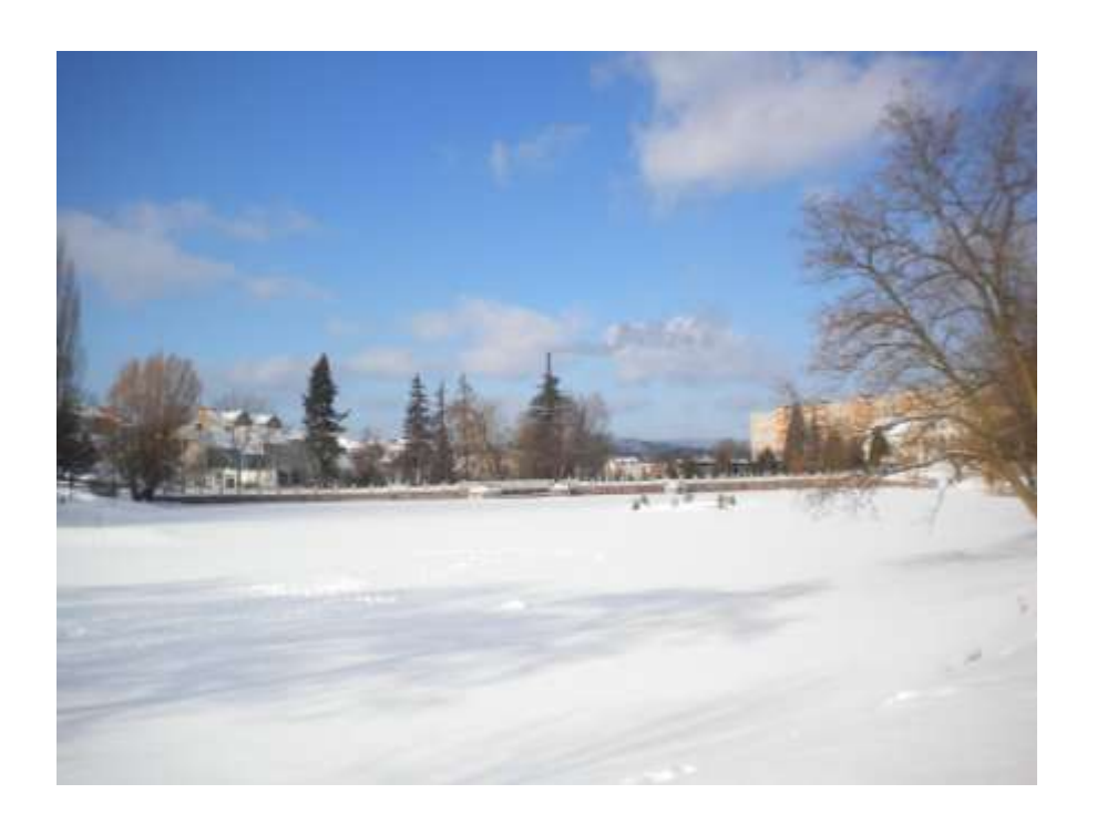
Memorial Vojna in Lešetice (Památník Vojna)

In winter when it is freezing cold, people may skate on the pond.